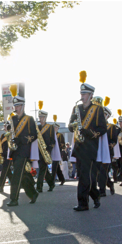
Go Marching in (left): Northwest saxophone players march by family, friends, and fans of instrumental music in the Harvest of Harmony parade.